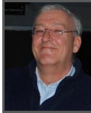
Reporter, DoD News